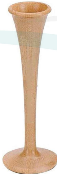
PINARD 242.18 18 cm/7"