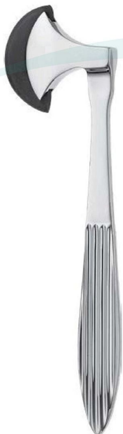
BERLINER 040.20 20 cm/8"