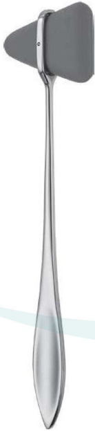
TAYLOR 010.18 20 cm/8"