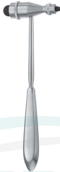
TROEMNER 034.24 22 cm/8¾"