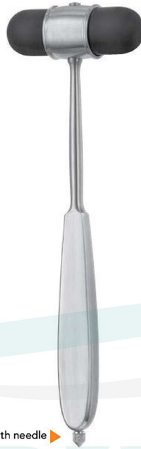
with needle ▶ DEJERINE 022.21 21 cm/8"