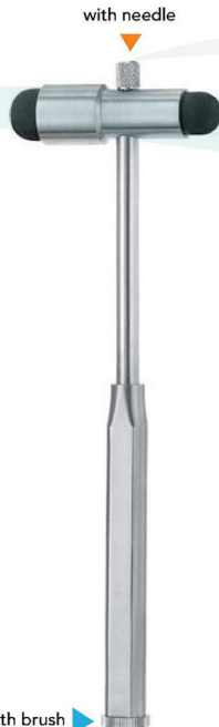
with brush ▶ BUCK 052.18 18 cm/7"