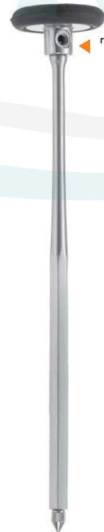
reversible head BABINSKY 076.22 21 cm/8"