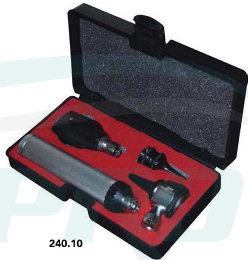
Ophthalmoscope & Otoscope Set