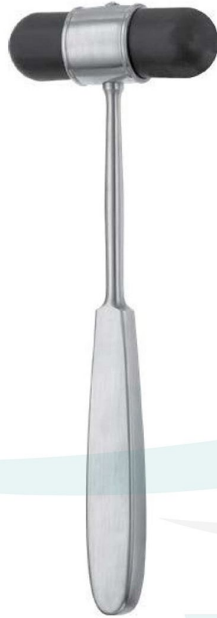
DEJERINE 016.20 20 cm/8"