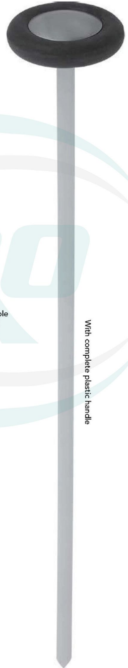
NATIONAL HOSPITAL 082.50 35 cm/13¾"