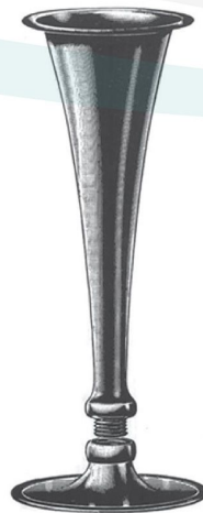
PINARD 248.15 15 cm/6"